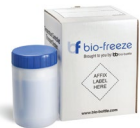
Bio-Freeze Complete Bio-Bottle

For protection, flexibility, and choice in the Lab and made from 100% virgin polypropylene to help maximum clarity for biological work