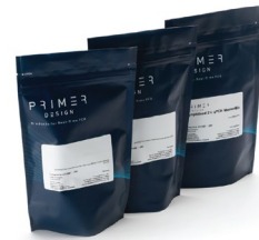
Genesig Advanced qPCR Detection Kit for Coronavirus (Strain 2019-nCoV) - RUO