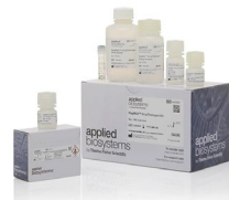
MagMax Viral/Pathogen Nucleic Acid Isolation Kit