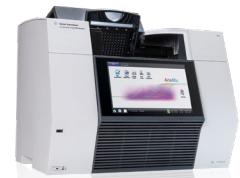
Agilent AriaMX Real-Time PCR System