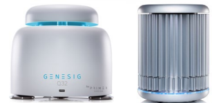
Real-Time PCR Genesig Q32 & Genesig Q16